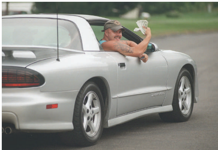
Passing mood: lottery winners and accident victims both seem to revert to their prior levels of happiness.